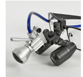
(Loupe Mounted (FLM))