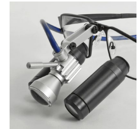
(Loupe Mounted (TTL))