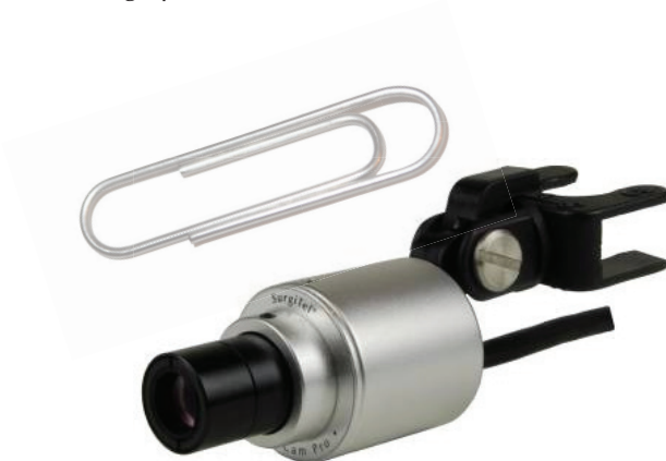
Small and light weight