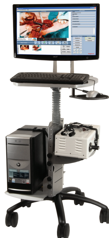
Optional computer stand