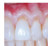
Others' Cool, Blue Tinted LED